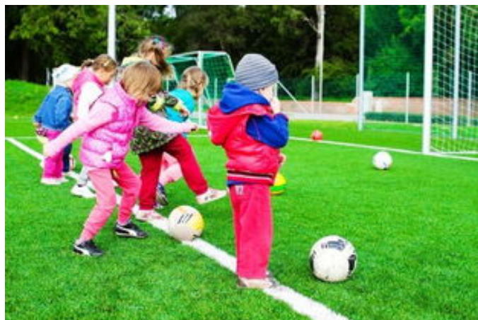
Figure 2 Poor posture of young children