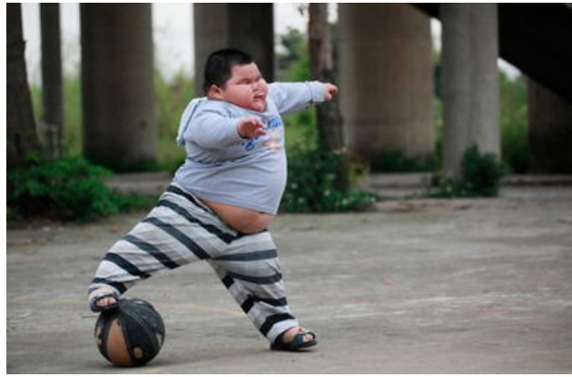
Figure 3 Poor posture of young children